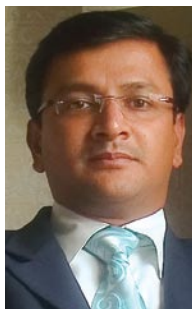
MEHTA: Big pharma firms prefer suppliers with greener processes.