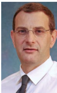
COTTIER: Introduced new products and services to control costs.

SAFC launched the vendor auditing services program earlier this year to trace and assure the quality of raw materials and intermediates. The service conducts audits worldwide and helps reduce inefficiencies.