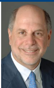
MADDALUNA: Consolidation of manufacturing is inevitable.

The pharmaceutical market has become more competitive and, to sustain an edge over their competitors, most manufac-