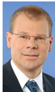
STOLLE: Affordability in emerging markets represents a big hurdle.

The use of better manufacturing processes, including green technology, is also