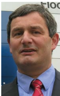
GEBHARD: Scaled up more than 30 industrial enzymatic processes.