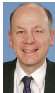
SIMS: Cost challenge passed on to contract manufacturers.