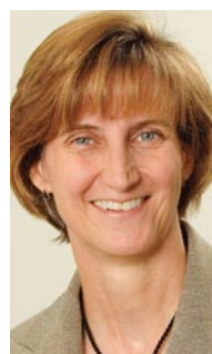
WHITE: All drug development costs must be scrutinized.